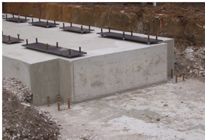
LOW PROFILE RAILROAD SCALE FOUNDATION

We also offer a fully electronic portable truck scale. Equipped with siderails, indicator and printer.