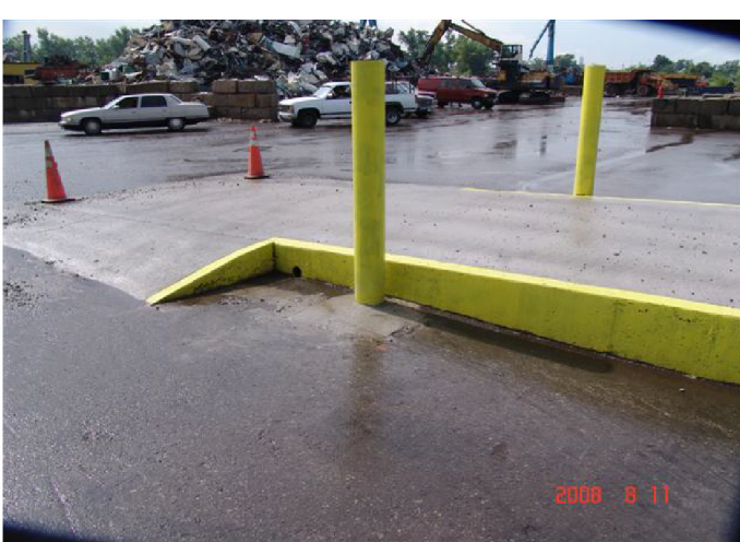
CONCRETE RAMP WITH CUSTOM FLARE AND BOLLARDS