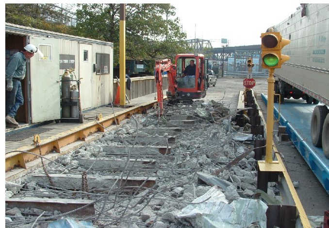
DEMOLITION WITH A TEMPORARY SCALE